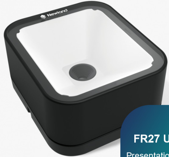
FR27 Urchin Presentation Scanners